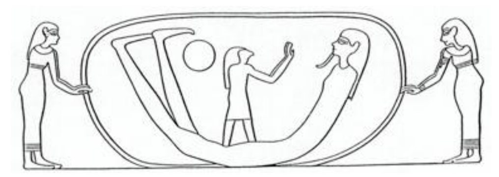
Figure 1-The Drop of Semen in the Womb The bent body of the father Osiris lies in the drop of semen Stricker, Birth II, Fig. 16: 90.