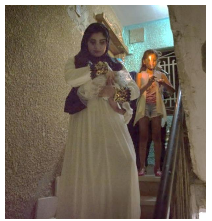
Figure 6-The mother holding the newborn walks down the stairs with the rhythm of the banging pestle and mortar

Behind her, children carry candles to light her path.