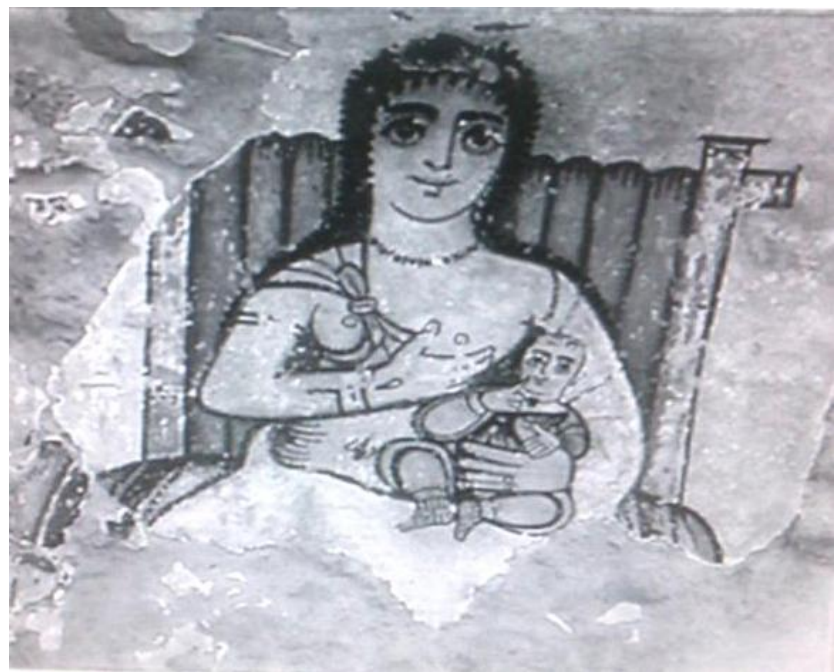
Figure 3- Water colour of mural of Isis, from a domestic structure at Karanis House B 50 Kelsey Museum of Archaeology, KM 2003.2.2.