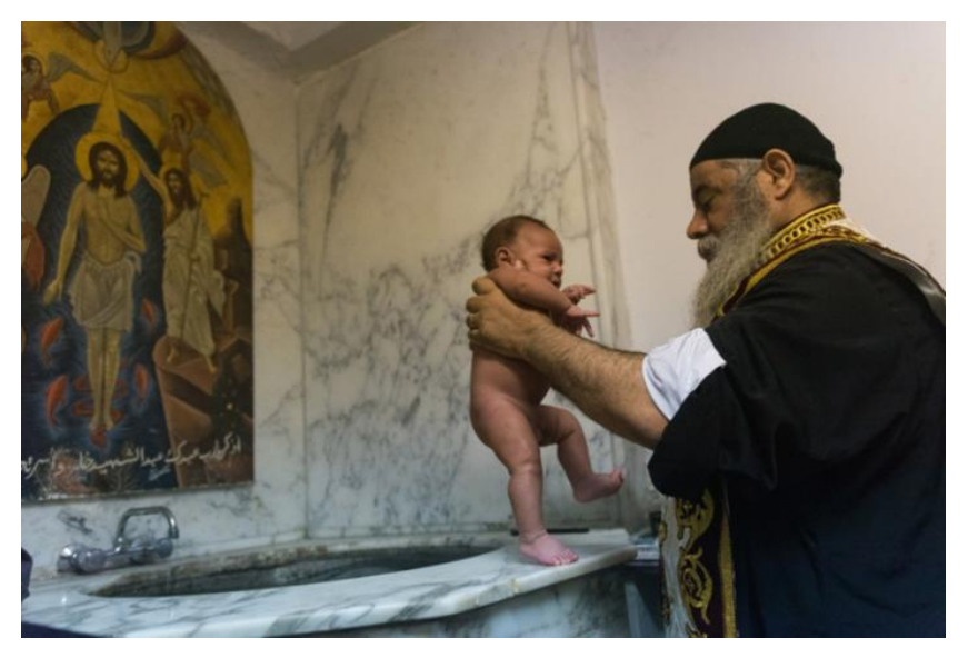
Figure 5- Baptism