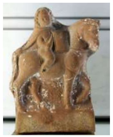
Fig.9 Terracotta figurine of Harpocrates represented as a Macedonian soldier, Roman Period, 3<sup>rd</sup> century A.D., Museum of Fine Arts of Lyon, H 2349. https://commons.wikimedia.org/wiki/File:Harpocrates_riding_MBA_Lyon_H2349.jpg