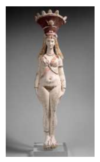
Fig.12 Terracotta figurine of Isis Aphrodite from the Roman period, Metropolitan Museum, Acc.1991.76

\underline{https://www.metmuseum.org/art/collection/search/544919}