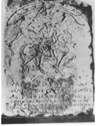
Fig.5 Stela from the temple of Heron at Thedalephia 76 B.C, LEWIS, The Iconography of the Coptic Horseman, FIG.35.