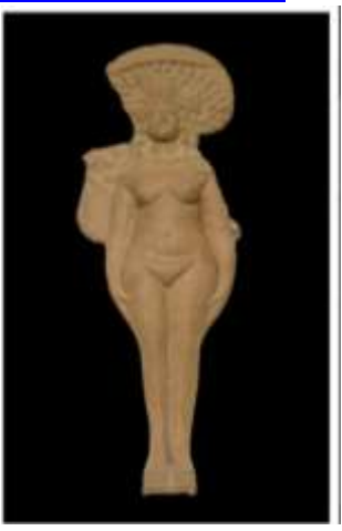
Fig.13 Terracotta figurines of Isis-Aphrodite in Antiquities Museum <a href="http://antiquities.bibalex.org/Collection/Detail.aspx?lang=en&a=451">http://antiquities.bibalex.org/Collection/Detail.aspx?lang=en&a=451</a><a href="http://antiquities.bibalex.org/Collection/Detail.aspx?lang=en&a=127">http://antiquities.bibalex.org/Collection/Detail.aspx?lang=en&a=127</a>