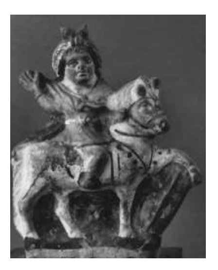
Fig.8 Terracotta figurine of Harpocrates wearing Roman military costumes, Roman period, Louvre Museum, CA 658,

https://www.britishmuseum.org/collection/object/Y_EA24372