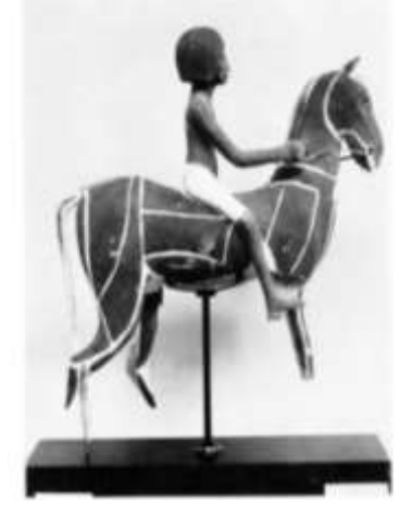
Fig.1 Wooden statuette of a horseman from the New Kingdom, Metropolitan Museum of Art, Acc. Nº.55.167.3.

SCHULMAN, Egyptian Representations of Horsemen, Pl., XXXVIII, FIG.2