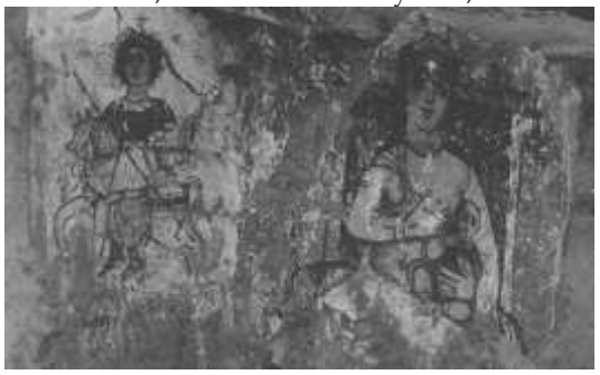
Fig.4 Mural painting of Heron at the niche of House B50, Karanis Cribiore, Trimithis in the Culture of the Eastern Roman Empire, 347, FIG.144 <a href="http://dlib.nyu.edu/awdl/isaw/oasis-city/">http://dlib.nyu.edu/awdl/isaw/oasis-city/</a>.