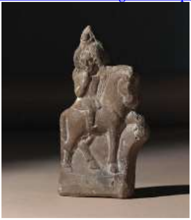
Fig.7 Terracotta figurine of Harpocrates wearing the double crown and riding a horse, Ptolemaic Period, British Museum, EA24372

https://collezioni.museoegizio.it/aspx01321