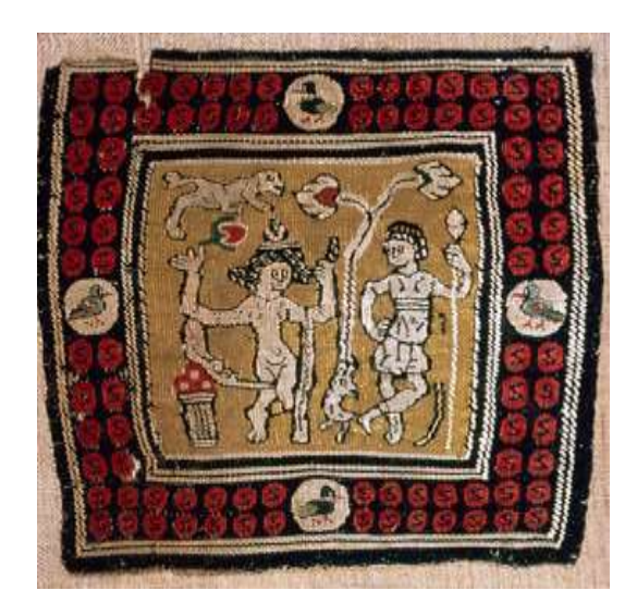
Fig.15 Coptic square of fabric from the 8th century, Louvre Museum <a href="https://www.louvre.fr/en/oeuvre-notices/square-fabric-illustrating-aphrodite-s-marriage">https://www.louvre.fr/en/oeuvre-notices/square-fabric-illustrating-aphrodite-s-marriage</a>