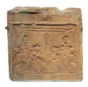
Fig.6 A sandstone stela represented with Dioskouroi the two twin brothers, from the Roman Period, Turin MuseumInv. N^{\circ} . S. 01321.

https://collezioni.museoegizio.it/aspx01321