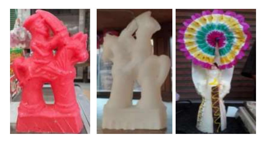
Fig.16 The modern sugar doll ( Aroset Elmouled ) and horseman ( Hosan )