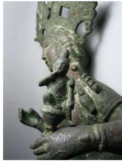
Fig.17 Bronze statuette, Brooklyn Museum, Roman period, Acc.44.224 <a href="https://www.brooklynmuseum.org/opencollection/objects/57407">https://www.brooklynmuseum.org/opencollection/objects/57407</a>