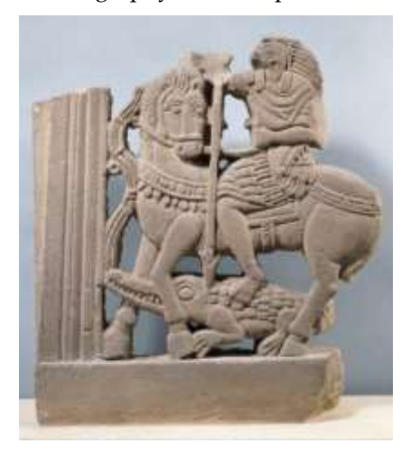
Fig. 11 Coptic sandstone relief, 5<sup>th</sup> century, Museum of Louvre <a href="https://www.louvre.fr/en/oeuvre-notices/horus-horseback">https://www.louvre.fr/en/oeuvre-notices/horus-horseback</a>