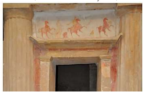
Fig.3 Frieze in tomb 1 in Mostaha Kamel, 3<sup>rd</sup> century B.C. Cole, Ptolemaic Cavalrymen, 7.