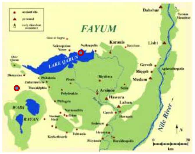
Map 2 map of ancient Fayoum showing locations of Karania and Theadelphia <a href="http://www.desheret.org/Fayum.htm">http://www.desheret.org/Fayum.htm</a> (Access April 15, 2021)