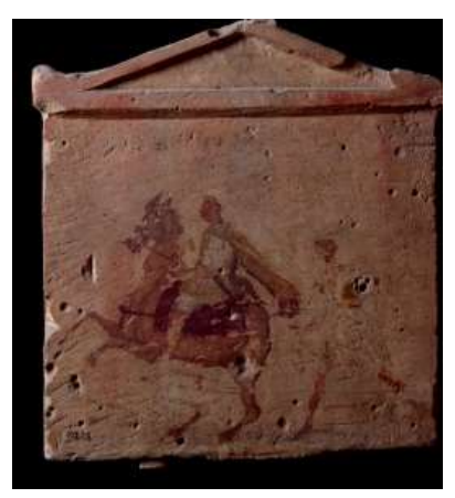
Fig.2 Funerary Stela from Shatbi Cemetery, late 4^{th} century B.C Cole, Ptolemaic Cavalrymen, 7.