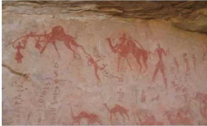
(FIG. 4) A very characteristic station of the times the most recent rock art of Tin Itinen, Tassili-n-Ajjer: tiffinagh, associated with horsemen; and camel drivers hunting.

RANDO, T., peintures rupestres du Tassili n-Ajjer