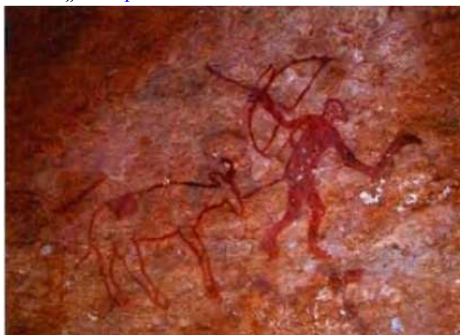
(FIG. 3) Chariot with flying gallop with stick-headed figures (Tamadjer, Central Tassili / Archer of Jabarin (Tassili -n-Ajjer) probably masked, holding a curved weapon in one hand and his bow and arrow in the other https://www.google.com/imgres?imgurl=https%3A%2F%2F1450v.alamy.com/ Accessed on December 2023.