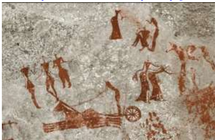
(FIG. 2) Painting in caballine style Tahunt Tehosekit. Tassili-n-Ajjer https://aars.fr/etat-des-connaissances/ Accessed on Decembre 2023.