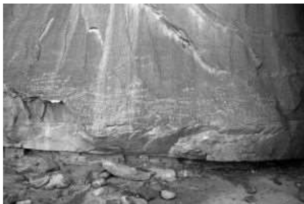
(FIG. 8) Inscriptions of the Tin Lalan Tdrart region of Akakus BIAGETTI & OTHERS, «Writing the desert: The Tifinagh Rock Inscriptions of the Tadarat Acacus (southwestern Libya)», 158.