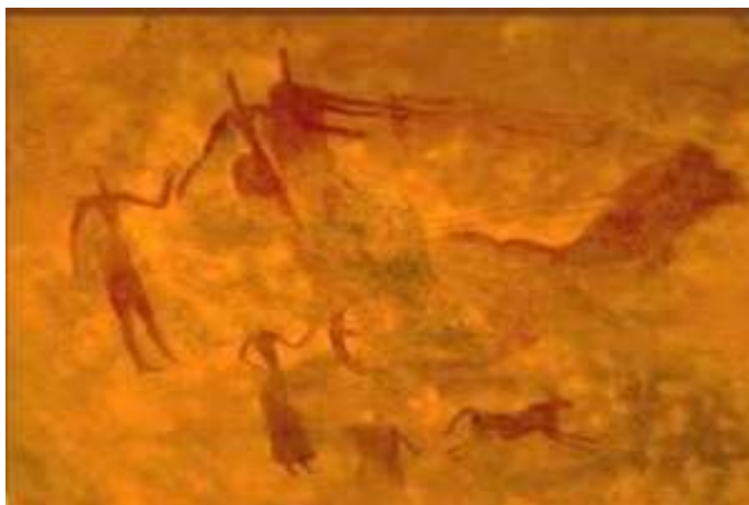
(FIG. 1) Caballine characters, Eberer, Tassili -n- Ajjer https://www.futura-sciences.com/sciences/dossiers/prehistoire-sahara-neolithique-232/page/9 Accessed on January 2024.