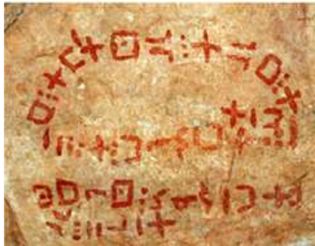
(FIG. 7) Saharan inscription in characters Tifinagh, Tadrart Akukas

(Le Quellec, "Rock Art, Scripts and Proto-Scripts in Africa: The Libyco-Berber Example", 13.