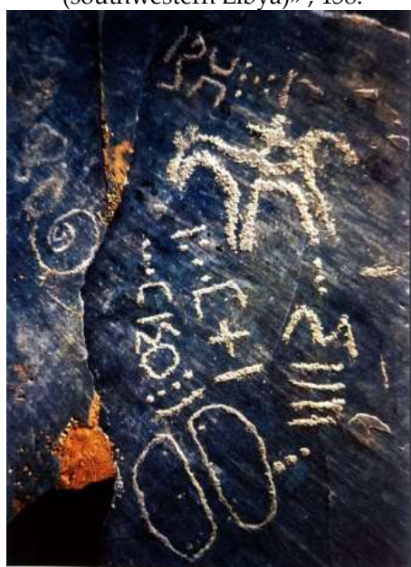
(FIG. 8) Engraving from Tifinagh containing horses AÏN-SEBA, l'art des origines , 78.