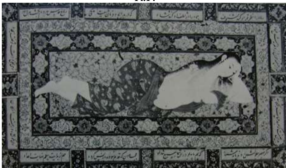
After: Ernst Kühnel, The Classical Style, pl. 50