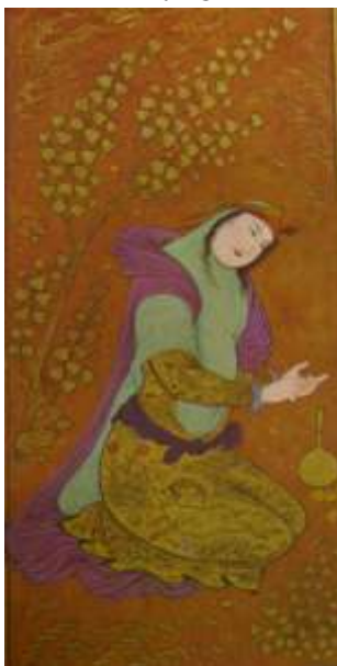
After: B.W. Robinson, Persian Drawings, pl.61