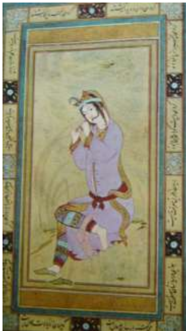
After: B.W. Robinson, Persian Drawings, pl.64