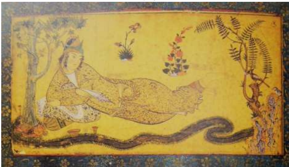
After: Barbra Brend, Islamic Art, pl.111